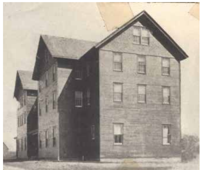
Men's three-story dormitory on Dalmeny Road.