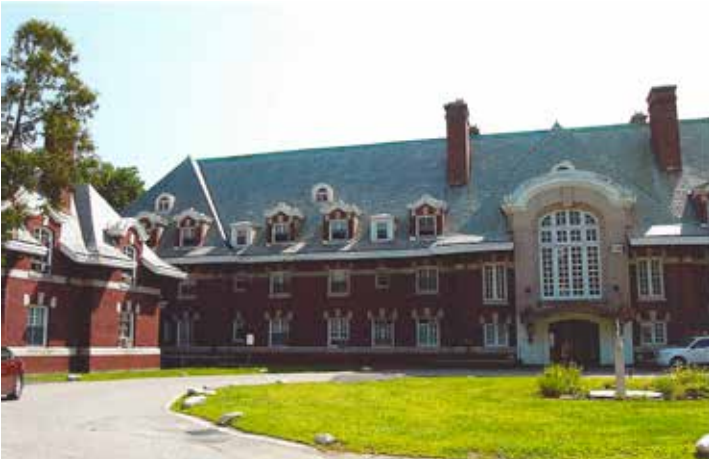
Mrs. Dow's School for Girls, original building

at the top of Elm Road, bordered by Tuttle Road