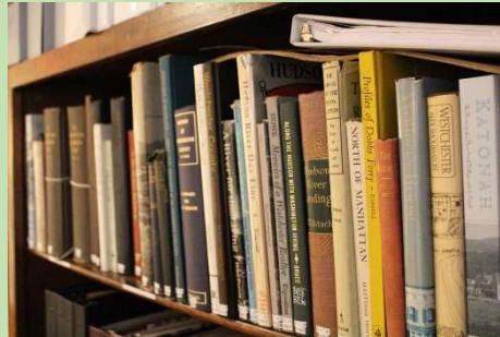
Figure 1: One of a number of BMSHS collections