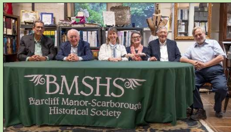
Figure 3: Our Board