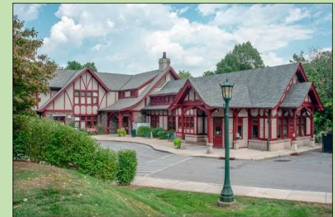
Figure 2: The Briarcliff Manor Library -Formerly a railroad station

We maintain an office and exhibit room in the Eileen O'Connor Weber Historical Center on the lower level of the current Village Library building.