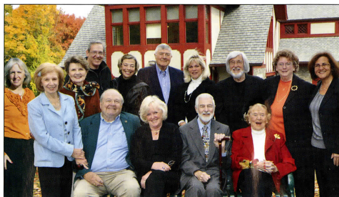
Officers and Board Members of the Society gathered outside our new home in the Briarcliff Library prior to the October Bus Tour