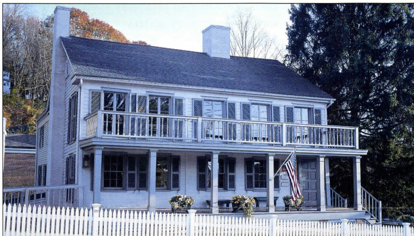
A nearby “Backyard Treasure”: Greeley House: built in the 1850s; home to Horace; almost demolished; saved; became a gift shop, then restaurant; now the New Castle Historical Society’s home, it was put on the National Register in 1979

Our annual meeting is never a “member’s only” function, but space is limited to approximately 80. Please put the date on your calendar and reserve space now by calling 941-4393 with the number in your party. This will help give us an accurate count. Many thanks.