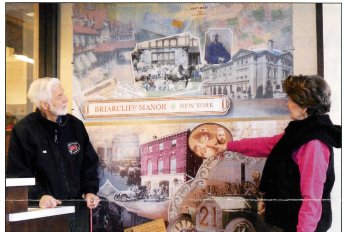
BMSHS provided scanned photos and captions for the new historical photo mural on the Wachovia/Wells Fargo Bank entryway wall